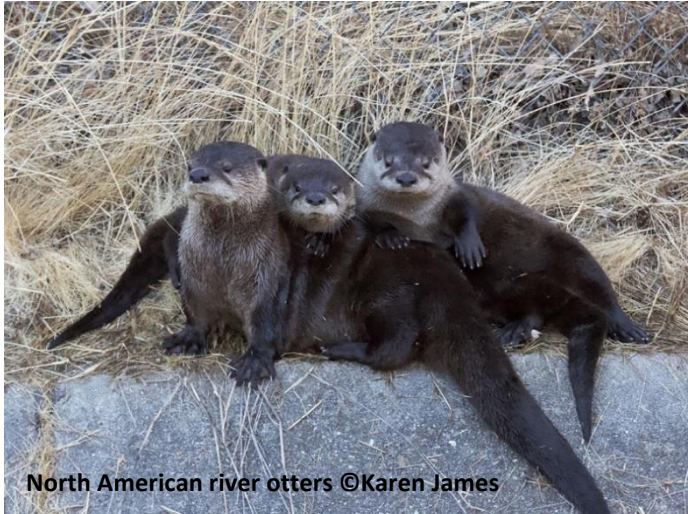
North American river otters

than poop from their cousins in cleaner water upstream. PCBs disrupt hormonal and neurological processes and affect reproduction in mammals. Both PCBs and PAHs are human carcinogens.”