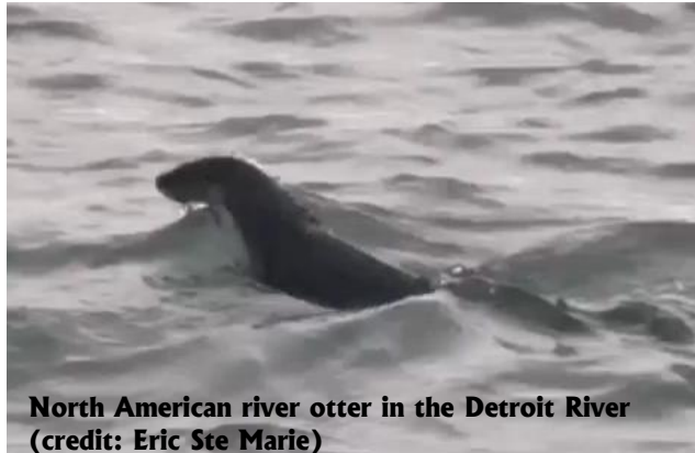
North American river otter in the Detroit River

One such place was the Detroit River. The river, which forms part of the border between the US and Canada (and Detroit, Michigan and Windsor, Ontario) is a small stretch of water which connects Lake St. Clair to Lake Erie. It is believed that otters have not resided in the river since the early 1900s but this has since changed.