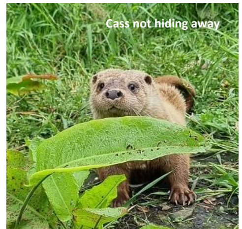
Cass not hiding away

Finally, Cass, who is doing very well but is a very reserved otter. She is extremely nervous during feeding time and we have to make a concerted effort to check on her as she insists on hiding in the safety of her sleeping box or dense vegetation before finally emerging, which is perfect.