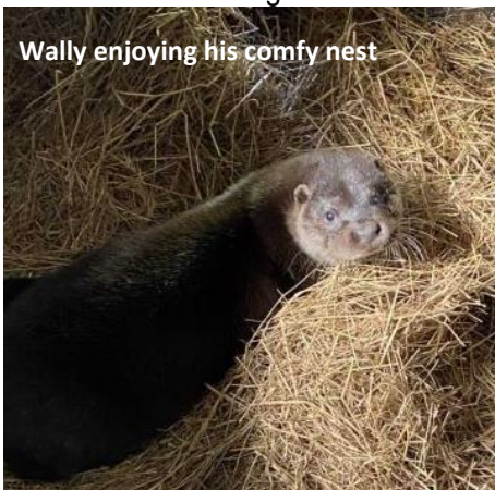
Wally enjoying his comfy nest

Wally too is growing bigger and bigger, seemingly by the day. Over the months he has grown in confidence and is using the whole of his extended pen now with obvious signs of his digging and landscaping work that otters are so keen to do!