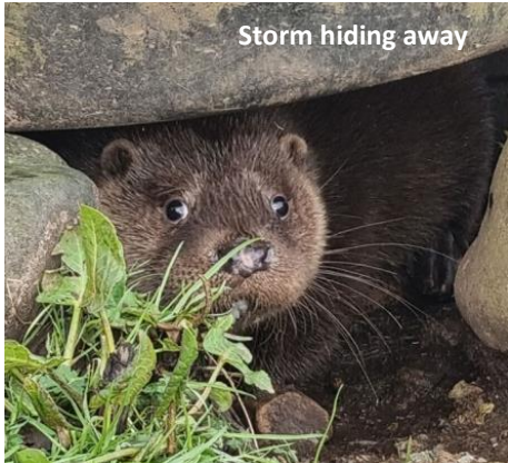
Storm hiding away

We reported in our last newsletter of how the “summer” on the Isle of Skye hadn’t been very summery at all and, in fact, was one of the wettest in our memory. Since then, the weather has improved somewhat. We haven’t been offered the warm sunny days that the rest of the country has had but we have had some improved days and less rain than previously.