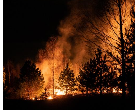
Photo of a wildfire