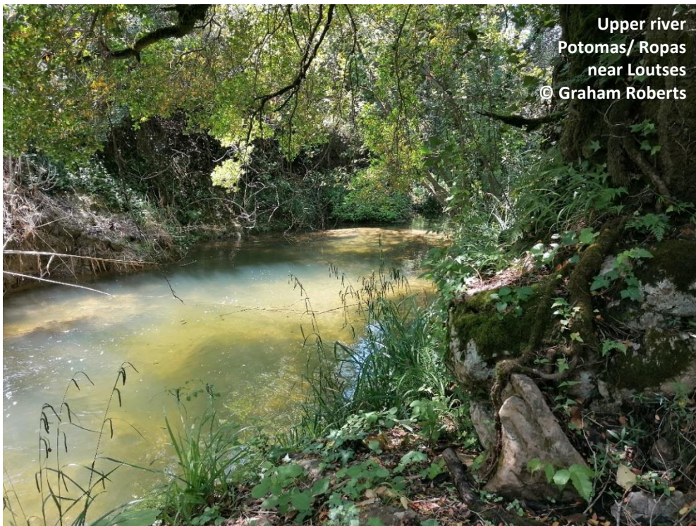
Upper river Potomas/ Ropas near Loutsas

is not large, possibly consisting of just a few individuals utilising large areas of the island, particularly the coast, at varying times of the year. There are small, undeveloped sections of coast, largely in the north, with small river estuaries and these appear to be important refuge sites. Some areas are close to the Albanian coast and it is highly likely that otters move naturally between the two countries, which would maintain this small island population.