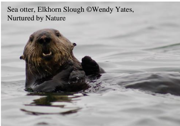
Sea otter, Elkhorn Slough

substantially from eco-tourists, with otters being the main reason for people to visit the area. So much of this economic gain can be put down to the otters themselves.