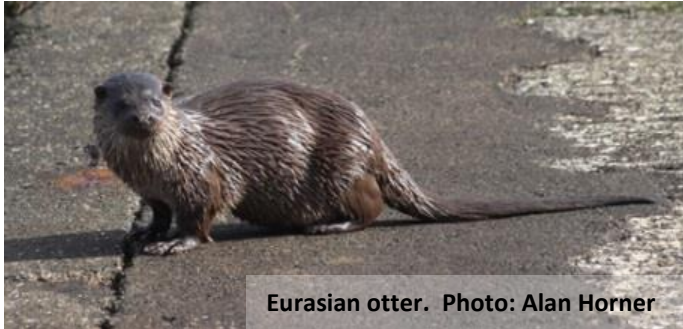
Eurasian otter.

A great story of success and the return of otters in the Netherlands! https://www.dutchnews.nl/news/2021/12/otter-caught-on-film-near-ijburg-first-amsterdam-sighting-in-over-50-years/