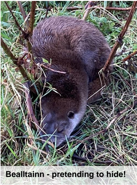
Bealltinn - pretending to hide!

have seen her return to her sleeping box praying for nicer weather when she can head back out. She is eating well and filling her sleeping box with her own bedding but we still have reservations over her ability to be released.