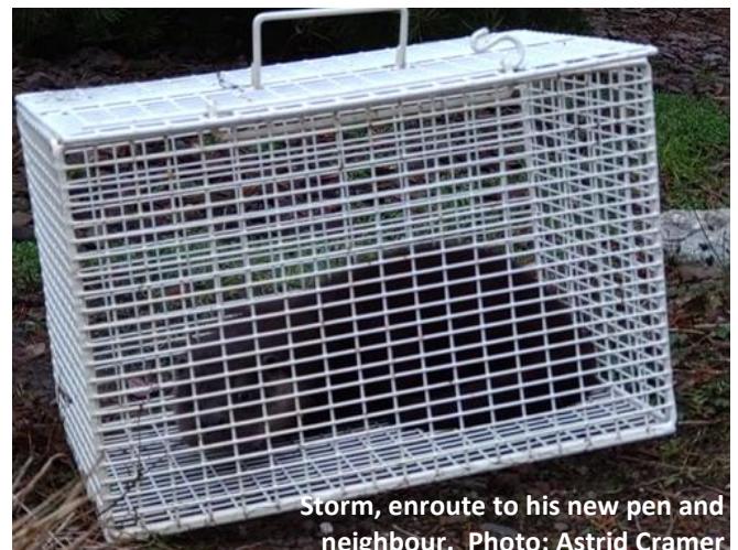
Storm, enroute to his new pen and neighbour.

Bealltainn is still much the same, though some storms in Skye