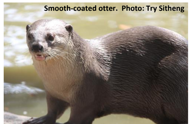
Smooth-coated otter.

https://www.todayonline.com/minute/otter-population-sharply-still-manageable-say-experts-who-urge-public-learn-co-exist-them-1767541