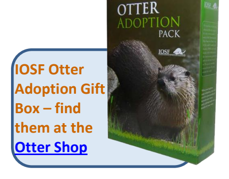
If you would like to support our cubs in the Sanctuary you can send a cheque marked "Hospital" on the back or make a donation online at www.ottershop.co.uk Thank you

Clearly though she is active when we aren't around as it has been really cold over the last few days and we have found holes in the ice on her pond where she goes in.