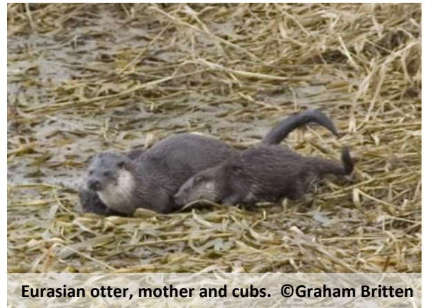
Eurasian otter, mother and cubs.

In the southern part of Germany, in Bavaria, otters were nearly extinct in the last century and they are protected by hunting law since 1960s. However, numbers continued to increase slowly in the last decades and first they spread into the fish farming area. The result was that the fish farmers began to complain about otter predation and they were calling for a cull. The authorities gave permission to kill some otters ignoring the protection through the European Fauna and Flora Habitat Directive and that the area of this federal state is only partly covered by an otter population. Two NGOs, the "BUND"-Bavaria and the "Action for Otter Conservation" were concerned about the recent permission for the cull and started an ongoing court case against the authorities. We should hope that the judgement will stop any killing of otters in Bavaria.