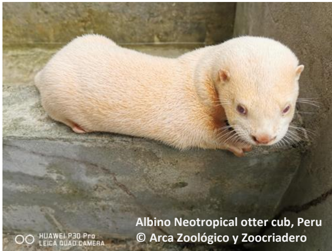
Albino Neotropical otter cub, Peru

A few weeks ago, IOSF was contacted by Arca Zoológico y Zocriadero in Iquitos, Peru, about a Neotropical otter cub that had been rescued in the area. It had been rescued by a fisherman and was very small but it did have tiny teeth.