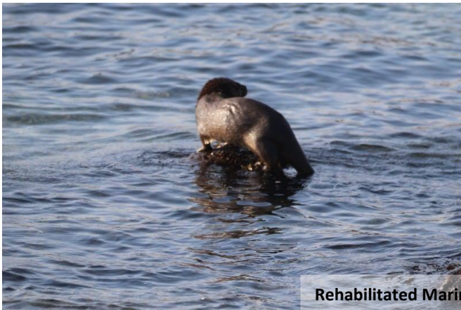
Rehabilitated Marine Otter

This organisation has already successfully reintegrated two “Chungungos” who came to their rehabilitation centre as young cubs. The two previous otters were only 2-3 weeks old on arrival and after two years of rehabilitation they were released.